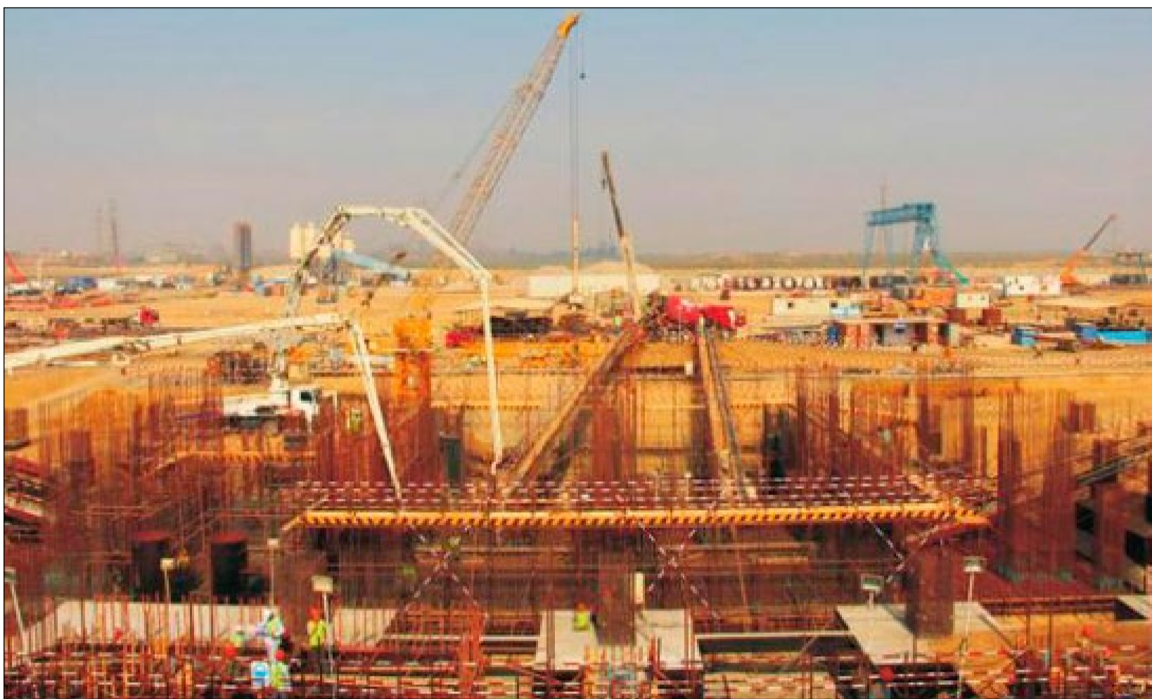
The Qasim Port Coal-Fired Power Project.

Now, China's National Development and Reform Commission, which is responsible for the Chinese side of the corridor project, and Pakistan's Ministry of Planning, Development and Reform have been working closely since 2015 to move ahead with corridor planning. The two countries have set up a joint committee to review progress on the corridor and this has allowed China's government bodies, such as the International Department of the Central Committee of the Communist Party of China, and the Ministry of Foreign Affairs, along with financial institutions and enterprises, to join Pakistani authorities in implementing construction and other priority plans, thereby making substantial