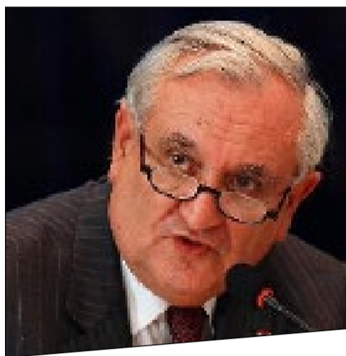
Jean-Pierre Raffarin , former prime minister of France