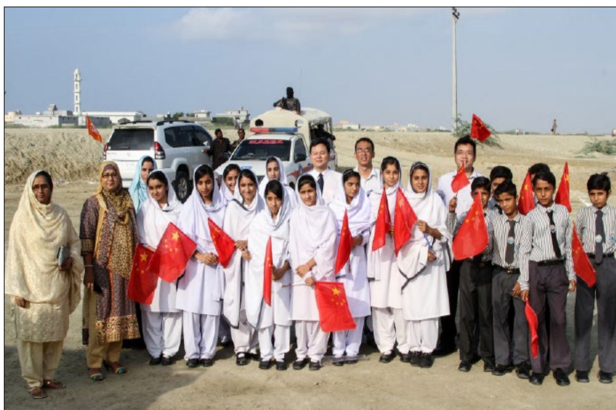
A cornerstone laying ceremony was held for construction of a primary school in Gwadar, on November 11, 2015.

This year marks the first year of China's 13th Five-year Plan and is a critical point for its ongoing structural reforms. China's Belt and Road Initiative, whose purpose is to promote global development and cooperation, reflects the common wishes of China and countries along it and will be a driving force for regional economic integration and globalization.