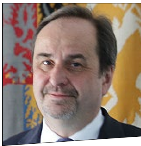
Jan Kohout , an adviser to Czech President Milos Zeman on Chinese matters