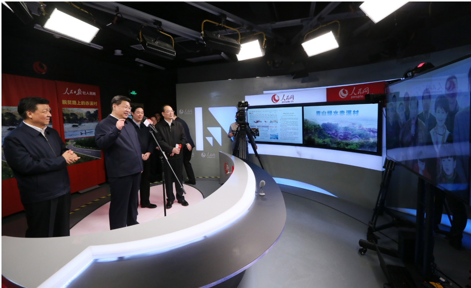
President Xi Jinping (2nd L) talks with villagers of Chixi Village in Ningde of southeast China's Fujian Province via video link while visiting the People's Daily in Beijing, on Feb. 19, 2016.

General Secretary Xi Jinping of the Communist Party of China (CPC) Central Committee, also Chinese president, visited the country's three leading media providers on February 19 and urged them to strictly follow the leadership of the Party.