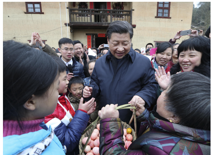
President Xi extends holiday greetings to villagers while visiting Shenshan Village in Jinggangshan, east China's Jiangxi Province, Feb. 2, 2016.

Xi's call for further civil-military integration not only relates to the management of military affairs, but also is a pivotal aspect of realizing the Chinese