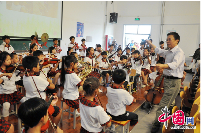
The orchestra of the Duan Village Primary School in northern China's Hebei Province puts on a performance on Sept.13, 2014, the first day of the school term.

It is foreseeable that simplifying governance and decentralizing powers will carry more weight this year. And this issue will attract national attention during the national "two sessions."