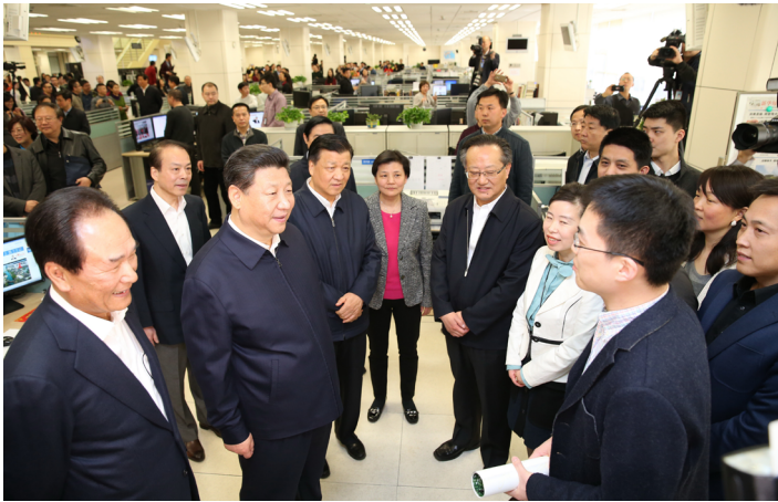
President Xi Jinping (2nd L, front) talks with a correspondent who is just back from reporting in Zhengding County of Hebei Province, at the headquarters of Xinhua News Agency in Beijing, on Feb. 19, 2016.

Liu Qibao, head of the publicity department of the CPC Central Committee, emphasized that the media should stick to guiding public opinion on the correct path, adopt innovative methods and improve their abilities.