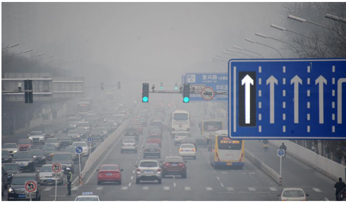
Vehicles run on a fog-shrouded road in Beijing, China, March 17, 2013.

Analysts say that local hot topics are often closely connected with those deliberations at the national level. The following is a roundup of highlights from the work reports of the 31 provinces (or municipalities and autonomous regions).