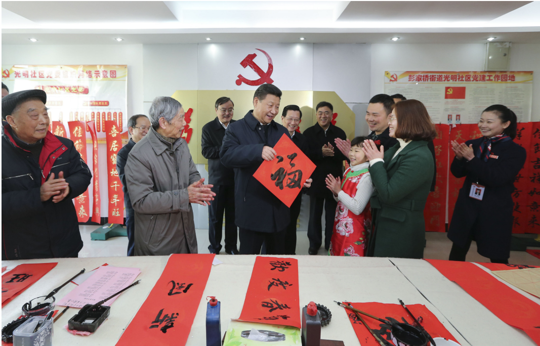
President Xi Jinping (3rd L, front) receives a calligraphy work by a girl with the Chinese character "Fu", meaning blessings, while visiting a community activity room in Donghu District of Nanchang City, east China's Jiangxi Province, Feb. 3, 2016.

General Secretary Xi Jinping of the Communist Party of China (CPC) Central Committee, also Chinese president, paid a visit to east China's Jiangxi Province from February 1 to 3, just ahead of the Spring Festival, or Chinese Lunar New Year.