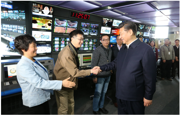
President Xi Jinping (R, front) shakes hands with staff members at the control room of China Central Television (CCTV) in Beijing, on Feb. 19, 2016.